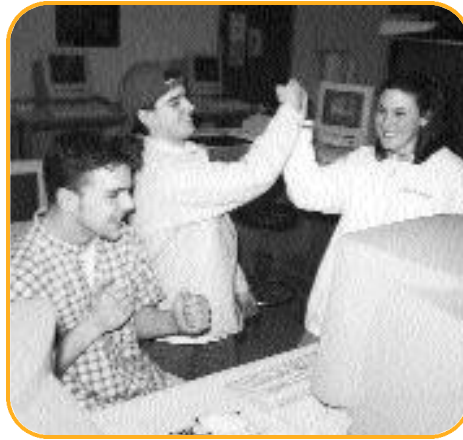
ABOVE: We got it! Students celebrate when their proposed genetics model accurately predicts eye color.